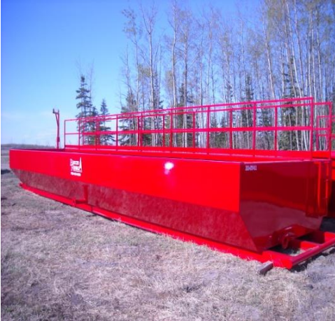
60m3 Floc Tanks