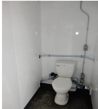
Her Washroom w/ Flush toilet