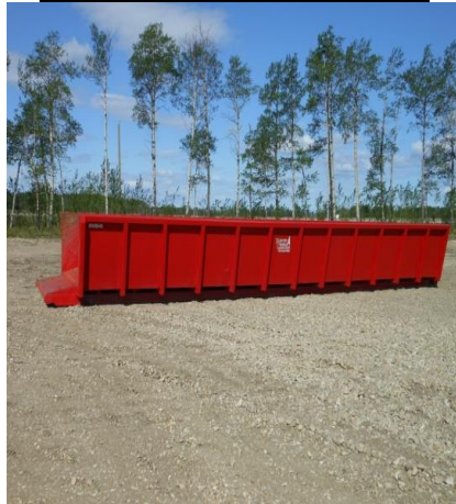
Low Side Shale Bins