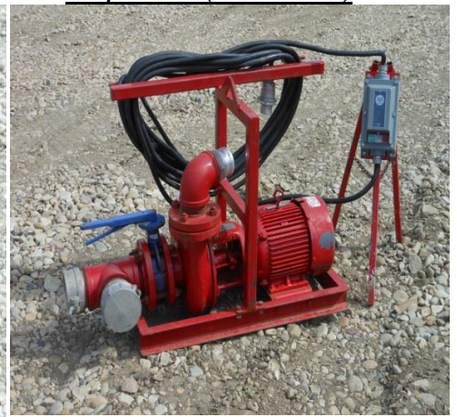
4x3 Transfer Pumps