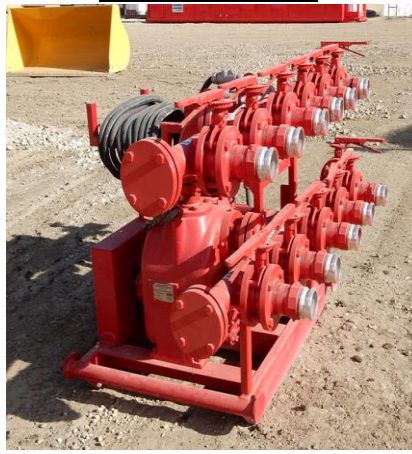
Gorman Rupp Transfer Pump