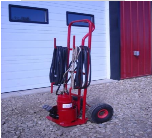
2" Trash Pumps