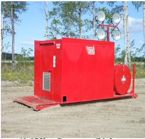
60-175kw Gen sets w/Lights