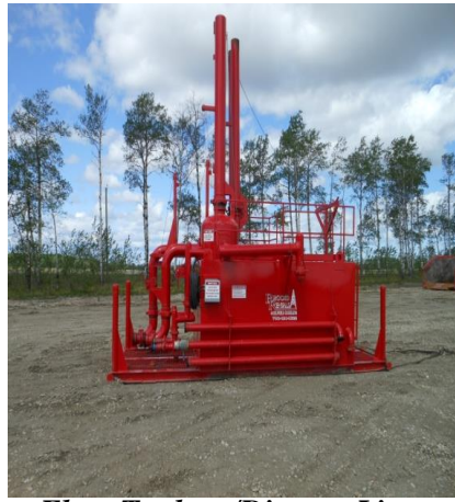
Flare Tanks w/Diverter Lines