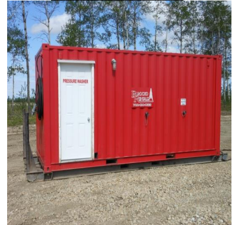
Hotsy Steamer/Water Storage