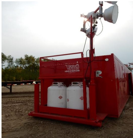
Light tower w/4-1500 watt lights 2 - 500lb Propane