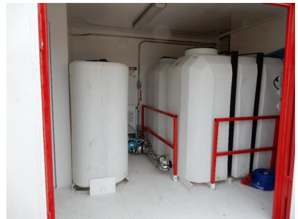
600gal Water Storage 300gal Sewer Tank