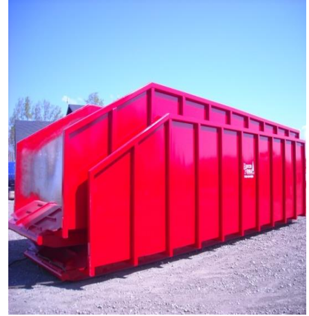
High Side Shale Bins