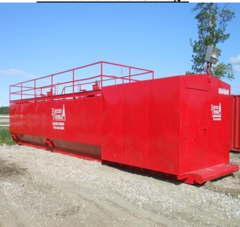
60m3 Pre-Mix Tank