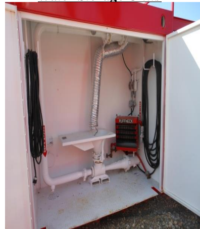
Insider Hopper Room