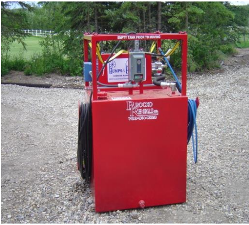
Base Oil Wash Guns