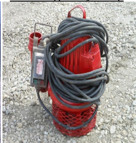
4" Trash & Flyte Pumps