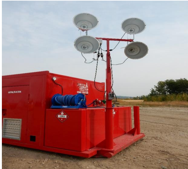
Light tower w/4-1500 watt lights Fuel Station

Our goal is to be on your lease with 1st class equipment and 1st class service We want to be your #1 call, if we don't have it, we will find it for you.