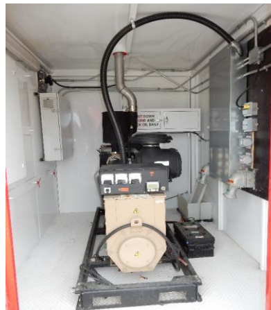
60KW Gen Full Distribution