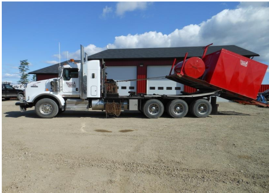
Tri Drive Texas Beds