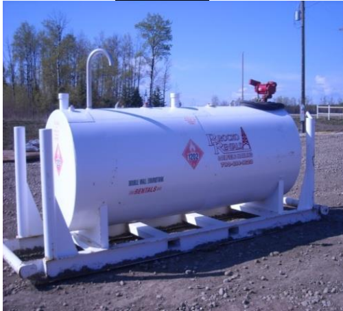
1000 Gal Double wall Tanks