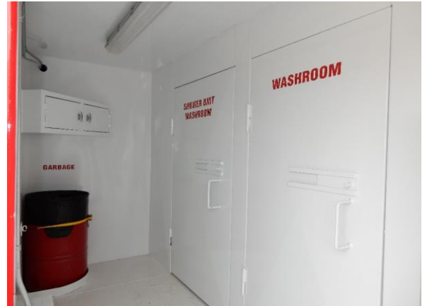
His & Her Washrooms w/Flush toilet