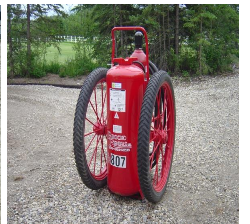
350lb Fire Extinguishers