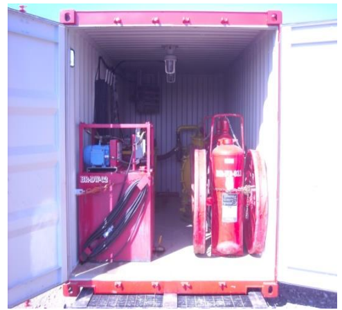
Enviro Vac Combo