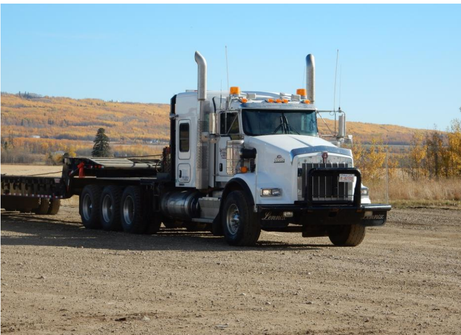
Winch Tractors w/Tri High or Tri Low