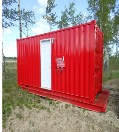
Water Storage Units