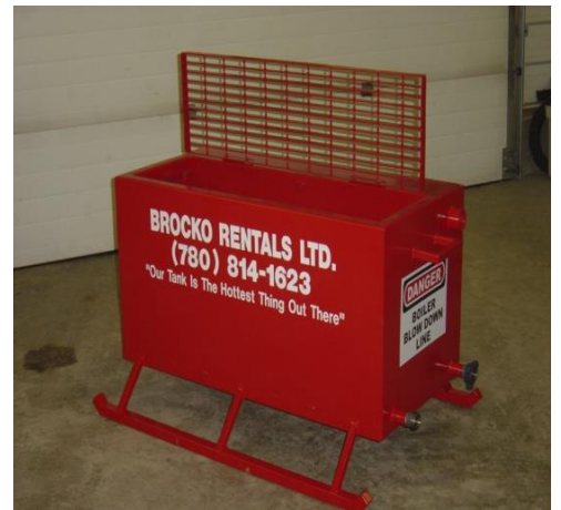
Boiler Blow Down Tanks