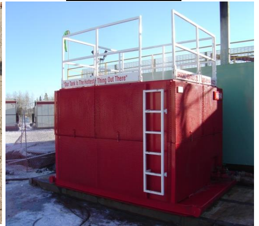
Evaporators (steam assist)