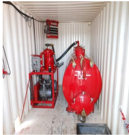
Inside Enviro Vac